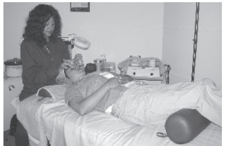
The patient is treated to a massage before the Lasik surgery